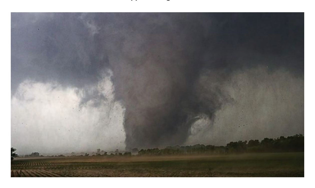
Photograph B for Question 5 The hazardous impact of a tornado