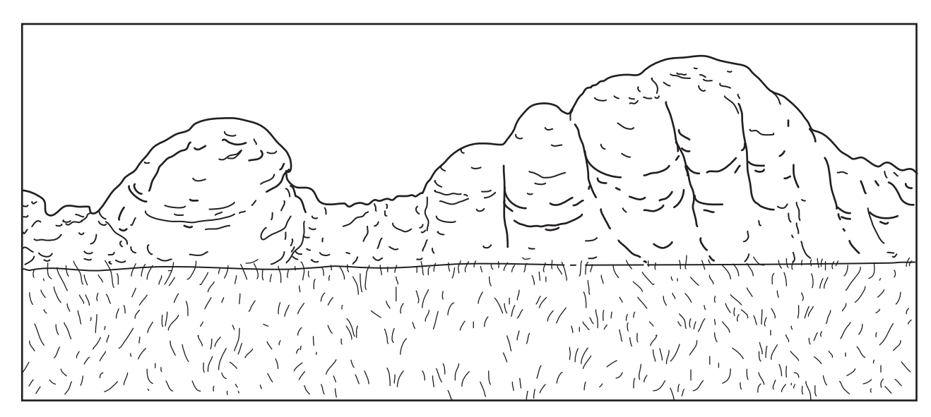
Fig. 1 for Question 2 A tropical landform in an area of granite